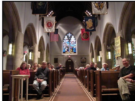
Church Service Following the Event