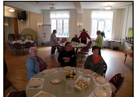
Reception for A.L.E.R.T. Volunteers