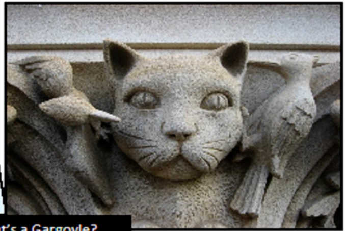
What's a Gargoyle?