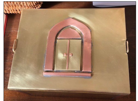
Insert Box (by Thuan Pham)