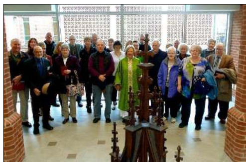
8 AM Worshipers