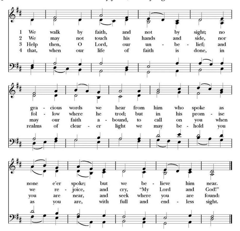
We walk by faith, and by sight