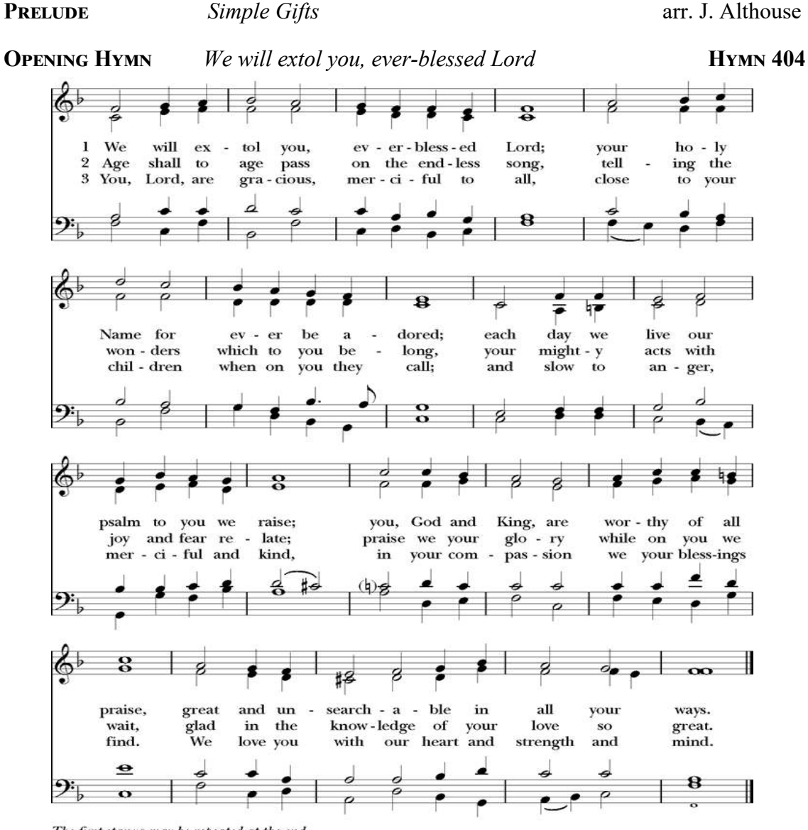
The first stanza may be repeated at the end.